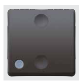
GW 21 589

\textbf{CHARACTERISTICS:} \ \text{supplied without lamp}.