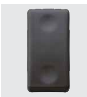
GW 21 510

GW21528 - not-illuminated product; equipped with neutral lens. APPLICATIONS: command of circuits requiring an interlock (e.g. operating motorised devices with direction reversal). 2-user selective control.