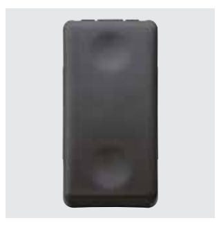
GW 21 579