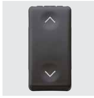
GW 21 559