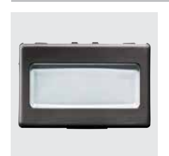
GW 21 024

ACCESSORIES SUPPLIED: GW21515 - red fluorescent 230Vac (0.4W) signalling unit. GW21516 - white LED 12/24Vac/dc (0.4W) signalling unit. GW21518, cord in insulating material, 140cm long, with a knob. GW21530 supplied with 2 keys. Spare keys: GW30912.