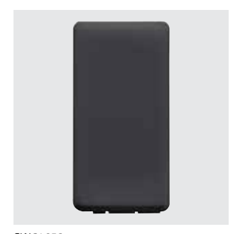
BLANKING MODULES AND CABLE OUTLET