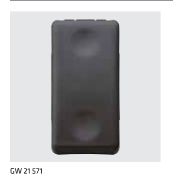
ONE-WAY SWITCHES - 250V AC