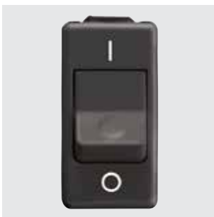
GW 21 585

ACCESSORIES SUPPLIED: GW21572, GW21504 - red fluorescent 230Vac (0.4W) signalling unit. GW21005 supplied with 2 keys. The key can be extracted in both positions. Spare keys: GW20901.