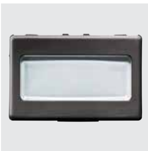
GW 21 024

ACCESSORIES SUPPLIED: GW21515 - red fluorescent 230Vac (0.4W) signalling unit. GW21516 - white LED 12/24Vac/dc (0.4W) signalling unit. GW21518, cord in insulating material, 140cm long, with a knob. GW21530 supplied with 2 keys. Spare keys: GW30912.