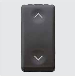
GW 21 559