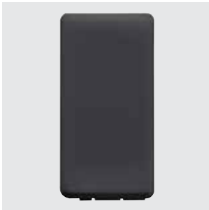
GW 21 056