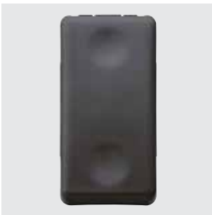
GW 21 510

APPLICATIONS: command of circuits requiring an interlock (e.g. operating motorised devices with direction reversal), 2-user selective control.