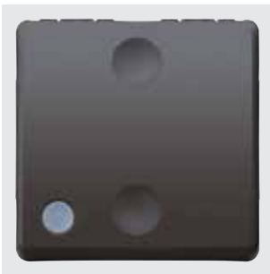
GW 21 589