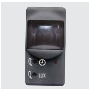
GW 21 821