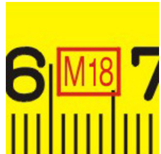
Year of manufacture