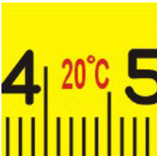
Working temperature condition