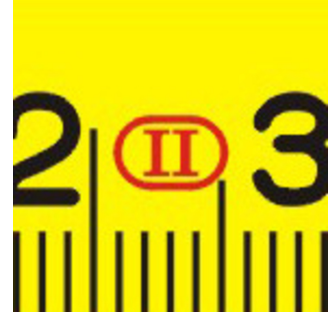
Preciseness to class II