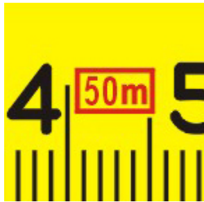
Length of tape