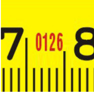
Notified body no.