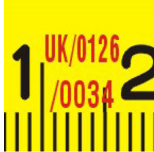
European type approval certificate