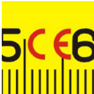
Manufactured in accordance with harmonised standards