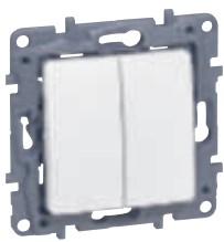
7 645 09