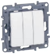
7 645 03