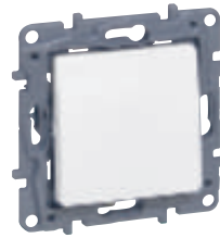
7 645 22

Mechanisms supplied with cover plates and support frames in flow-pack To be equipped with plates (p. 539) Fixing with screws or claws (supplied) Automatic or screw terminals