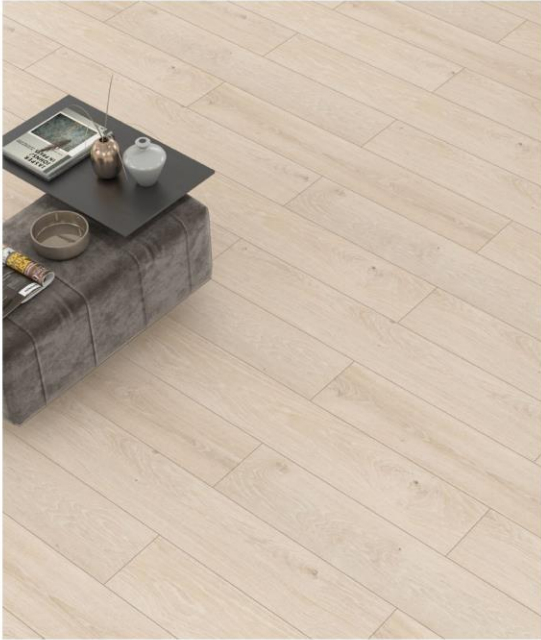
FSX06 SATEN MESE - SATEEN OAK (OTN)